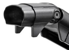
Flexible Handrail Joiner