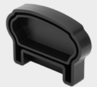
BALUSTRADE END CAP