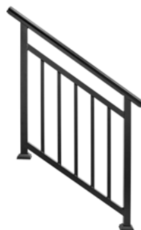
Balustrade Stair with Supplied Footcaps and Flexible Handrail