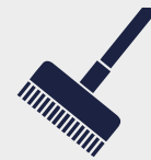
BRUSH / SPONGE