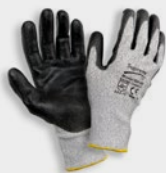
PROTECTIVE SAFETY GLOVES FOR DECKING