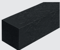
RECYCLED PLASTIC POSTS